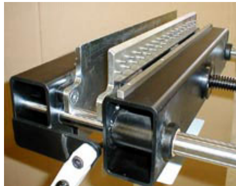
... with thread binding jaws