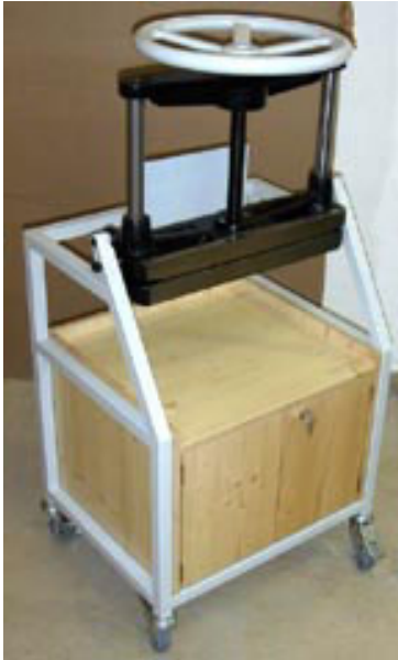
... as a standing press