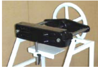
... as a nipping press